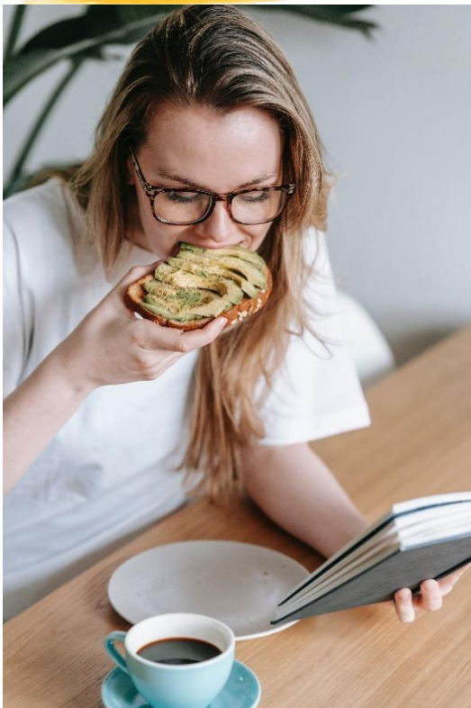
Image: Woman with avocado on bread

The increasing prevalence of plant-based diets, including veganism, vegetarianism and flexitarianism, means that many consumers have either not tasted the traditional flavour of animal products for a long time or even have never done so. This change marks a silent revolution with regard to taste as one of the senses, as the established reference values are disappearing. The variety of plant-based diets and alternatives to meat, fish, eggs and dairy products is getting bigger all the time, and shaping the sensory perception of large sections of society in a complex way.