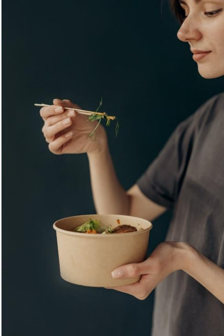
Image: Plantarianism is growing in popularity

satisfying these increased demands on the part of consumers include the use of various flavour intensifiers such as mild spiciness, the 'swicy' combination, a kick of umami, the use of fermented ingredients and 'high-level' indulgence, for example through dry-aged fish.