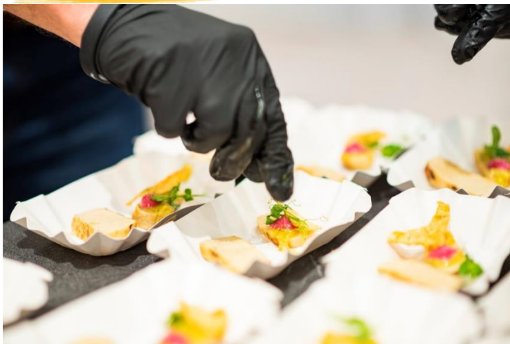
Image: Chutneys and relishes give dishes a fresh twist

Spiciness is a fixed and essential element of many national cuisines, but that is not the case in Germany. However, a trend towards spiciness is developing, especially in combination with sweet flavours. This has given spiciness a fresh twist and the corresponding sweet and spicy sauces, chutneys and relishes, which are used together with foods such as burgers, hot dogs and wraps, open up new culinary possibilities. Examples include sweet and spicy creations such as gochujang mayo, pineapple kimchi, date and harissa